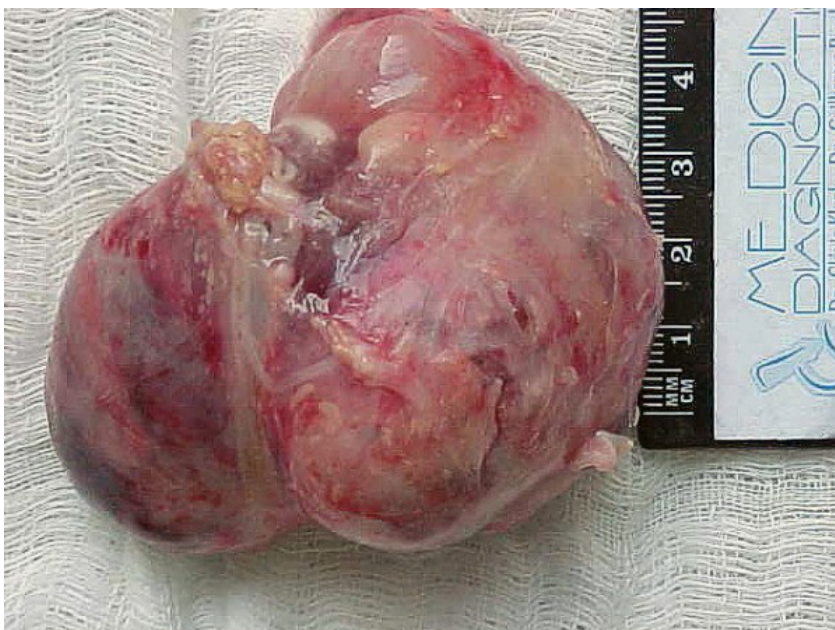
mediastinal mass -

A 36 years old pregnant woman was admitted at 32- weeks gestation and had a cesarean section with an outcome of a dead newborn. A previous ultrasound examination showed a living fetus with generalized edema. A necropsy was performed on the newborn according to the Perinatal Autopsy Manual (AFIP- 1983). Received was a dead fetus of 2780,0 g of weight, measuring 43,0 cm of length. The inspection of the thoracic cavity showed a 88,0 g, 7,5 x 6,0 x 3,5 cm, bosselated, pink - tan tumor mass in thymic topography, displacing the thoracic organs. All tissues were immersion fixed in formalin, routinely processed, embedded in paraffin and were sectioned and stained with hematoxylin and eosin. Histological samples showed mature epithelial and mesenchymal tissues and also mesenchymal and immature neuroepithelium. A diagnosis of immature teratoma was made