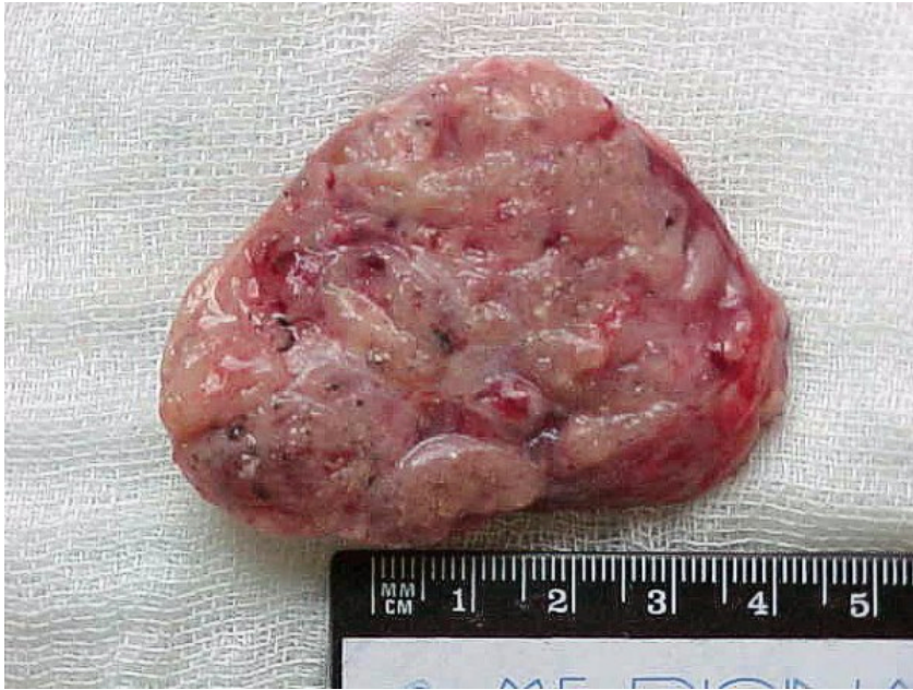
Mediastinal mass -